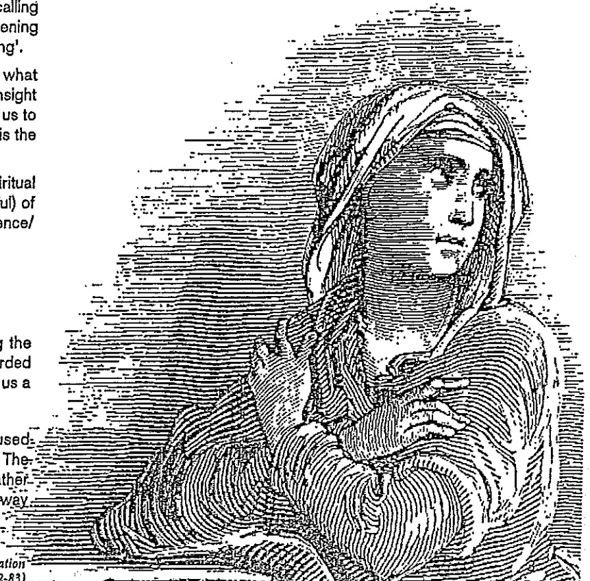
The Annunciation Dore, Gustave (1832-83)

But more importantly, she knew how to handle her inquisitiveness. On the one hand, she sought for meaning, understanding and answers. On the other hand, she did not let her inquisitiveness stand in the way. She did not insist that she had to understand exhaustively before giving her commitment. By faith and with submission, she courageously stepped up to face the challenge.